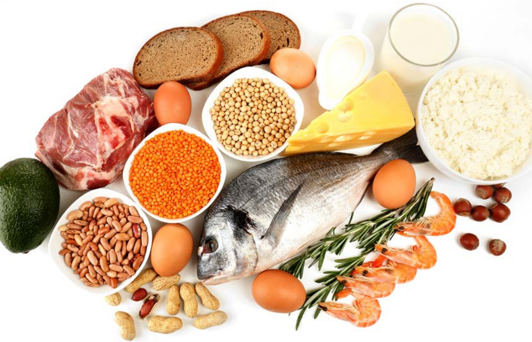
Table 7: DAILY PROTEIN RECOMMENDATIONS

Protein has always been a particularly popular nutrient with athletes because of its role in building and maintaining muscles. Indeed, athletes need to consume a wide variety of high-quality protein foods in their diets. However, while protein is necessary for rebuilding and repairing muscles, it is not the primary fuel, and consuming more protein than what the body can use is not going to give athletes larger and stronger muscles. While research shows that protein requirements are higher for athletes to aid in muscle repair and growth, most athletes are already consuming more protein than the body can use. Use the following formulas as guidelines to ensure proper amounts of protein are included in your dietary intake.