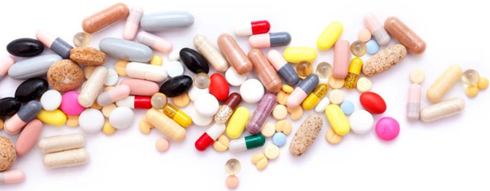
Table 11: MICRONUTRIENT SOURCES

Athletes should always choose food over dietary supplementation. The body needs more than 40 nutrients every day and supplements do not contain all the nutrients that are found in food. Supplements cannot make up for a poor diet or poor beverage choices.